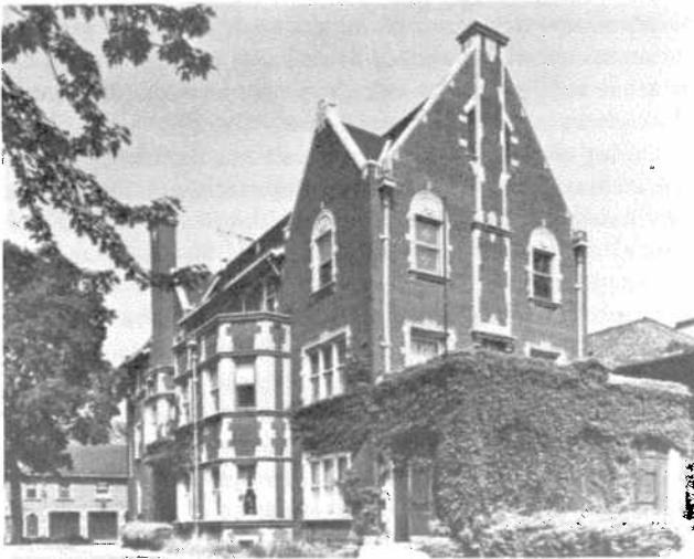
The suburban character of Kenwood derives from the many large houses set on spacious lots, such as the house at 4940 Greenwood Avenue which was designed in the Tudor style.

English architecture of various periods provided American architects with inspiration throughout the second half of the nineteenth century. In addition to the Queen Anne style houses, Kenwood has examples of residences based on the architecture of the period of Elizabeth I and James I. This style, sometimes called Tudor or Jacobethan, had been illustrated in American architectural publications beginning about the middle of the nineteenth century, but was not used in the design of actual buildings until about 1890. The house at 4940 Greenwood Avenue displays many features of this style: a wide rectangular bay window on the south facade; brick walls with decorative stonework, especially on the chimney and around window and door openings; ornamental stone panels set into the tops of chimneys and gables; and intersecting steeply pitched gable roofs.